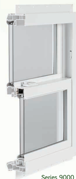
Series 9000 Single Hung